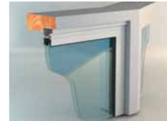
Insert Window Head Detail

Condensation is a common problem in older homes. Double glazed insert windows will help to reduce condensation build-up ensuring a warm and dry home.