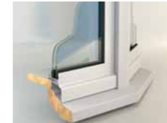
Insert Window Sill Detail