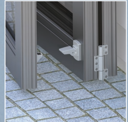
Bifold mount with short door stop