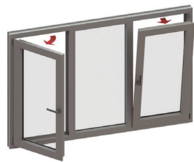
Inwards Tilt and Turn

We offer four main window types; Fixed Windows, Tilt and Turn Windows, Awning Windows and Casement Windows. Our windows can be customised to suit your house design and style. For renovation projects we can either match existing window styles, or many clients take the opportunity to re-think their window configurations. For new projects there is the opportunity for us to be involved early in the design process to ensure you get maximum benefits from the flexibility uPVC window systems offer.