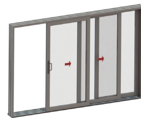
Multi Slide (Stacker)